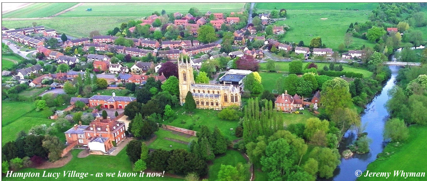
Hampton Lucy Village - as we know it now!