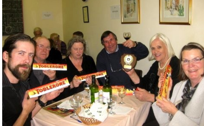
Charlecote Wine and Wisdom - February edition