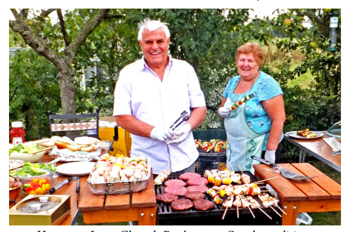
Hampton Lucy Church Barbecue - October edition