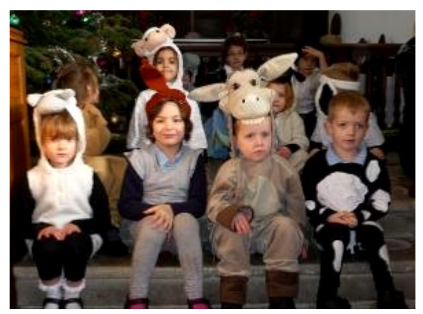
Loxley School Infants, Nativity - February edition