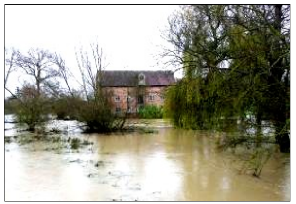
The Mill - Winter 2013