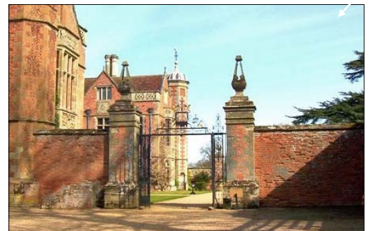
The gateway leading into the courtyard

November starts with a boundary walk in the park at 1pm – free, with normal admission charges only. On Thursday, 21 November, there is a 'Park to Plate' event, bookable at £25pp which includes a two hour guided walk in the parkland with the warden, looking at the management of the park and its animals. Following this, lunch in the Orangery will include Charlecote venison and, before leaving, participants will collect a sample of park-reared hogget and venison to cook at home. From Saturday, 9 November, the house will be open from 12noon until 3.30pm daily, except Wednesdays. The park, restaurant, and outbuildings will be open from 10.30am until 5.30pm and the shop from 10.30am to 5pm daily. Don't forget that the shop has a wide range of Christmas gifts and cards and that the ground floor of the house will be open and decorated for Christmas during the weekends in December. For further information please call Charlecote Park on 01789 470277 or see the website: www.nationaltrust.org.uk/charlecote