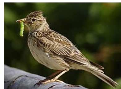
Skylark, Alauda arvensis

By the time you read this it will be May, hopefully spring will have arrived and the birds will be nesting. We are very proud that, according to the RSPB, Thelsford Farm has a greater diversity of wild birds than any other farm in Warwickshire. To keep it this way we need your help. Those tempting grassy margins which surround most fields are, in fact, conservation headlands. They harbour seed-producing plants, attract insect life and are a food resource and refuge for birds and small mammals. Retaining them encourages more wildlife, and birds in particular. If you walk along them with your dog, even if it is on a lead, ground-nesting birds, such as the skylark, ( pictured ), will be disturbed, and perching birds will be deterred from nesting nearby. We are glad you enjoy the beautiful countryside, but would be enormously grateful if you kept to the public footpaths and prevented your dog from roaming far and wide.