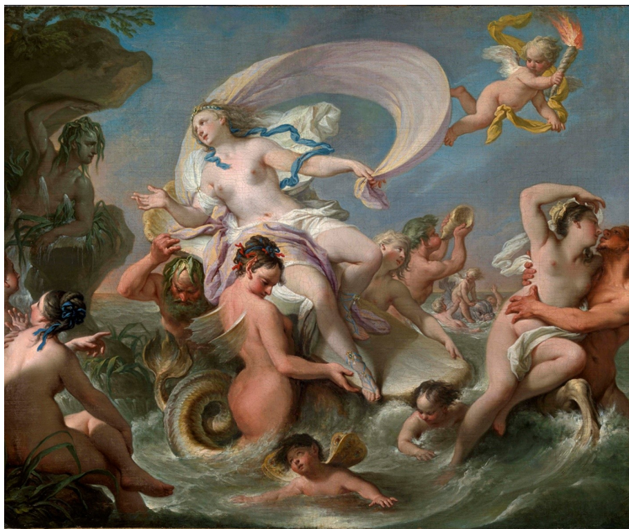
'The Triumph of Galatea' by Andrea Casali, (c.1740 - 1765)

Continuing with their mission to bring high quality exhibitions of artistic masterpieces to Warwickshire, Compton Verney is currently hosting a collection of over forty fine Italian paintings, beginning in the 15 th century with exquisite works by Bellini and Botticelli, followed by the beautiful and delicate 16 th century skills of Titian and Veneto, on into the 18 th Century with a magnificent painting entitled 'Triumph of Galatea' by Casali, and, finally, to the late 19 th century, illustrating the further development of artistic techniques under the delicate brush strokes of Luiga da Rios, Guardi and Andreotti. The exhibition is just part of a superb collection created by The City of Glasgow and whets the appetite for more! The designers have allowed a generous amount of space for the paintings and, by colouring the gallery walls as a rich, crimson backdrop, emphasise the gilding and vibrant colours of these old masters to great effect. The high ceilings of the gallery enhance the sense of grandeur and the