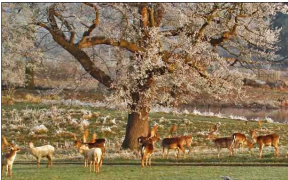
A Winter's Tail!