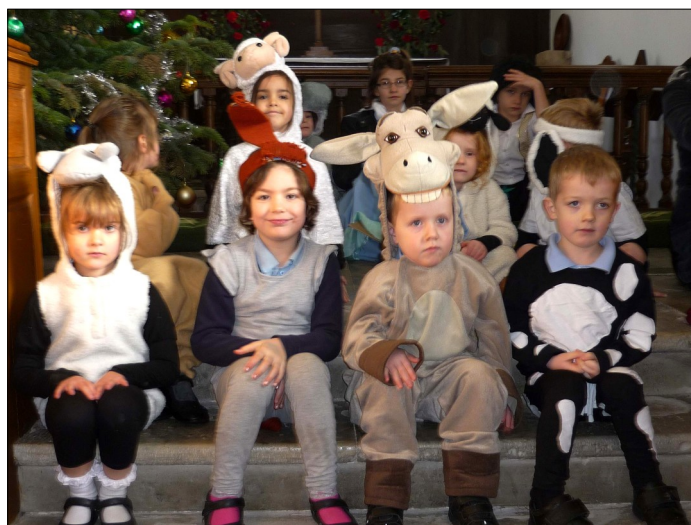
Loxley School Infants in Nativity mode