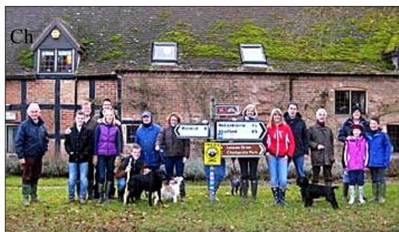
Now...which way is the pub?