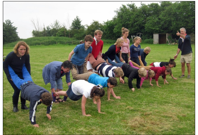
It's that transport problem again!