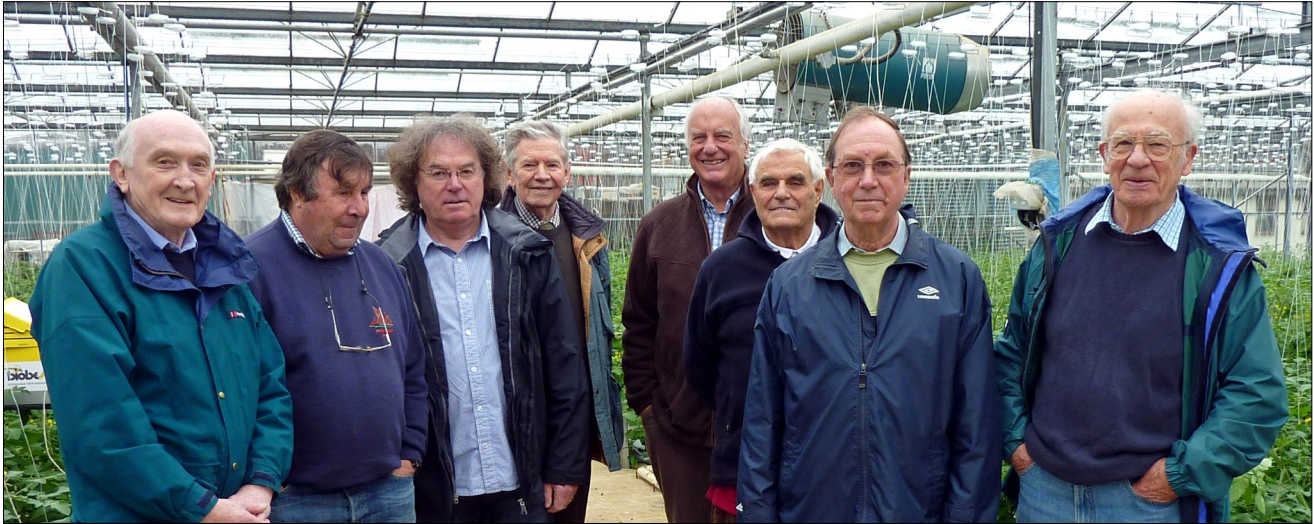
The Lucy Lads ... stylish and erudite...(well, some of them are!)

On Thursday, 3 May, the Lucy Lads were to be found surrounded by thousands of tomato plants. Hampton Lucy's residents are used to seeing Valefresco's lettuce crops growing in the surrounding fields, but these tomato plants grow in a two-acre glasshouse. Fortunately, the owners of Valefresco are always keen to show the public what they do and how they produce some of the safest food in the world, and invited the 'Lucy Lads' to visit their glasshouse at Offenham, near Evesham. It was fascinating to see that these tomatoes were growing in just a nutrient solution. Water and nutrients are added as required, the solution is stored in a central tank, automatically checked and adjusted by computer analysis, and then pumped along the plastic channels in which the plants grow. The flowers are pollinated by bumblebees from artificial hives within the glasshouses and all the plants bore lots of trusses of cherry tomatoes. The particular attraction of bumblebees is that they start work at dawn, continue working into the afternoon without a break, and visit every open flower - all on just a spoonful of sugar! We are most grateful to Nick Mauro and his uncle, who patiently answered all our questions, and are especially grateful to Jeremy Whyman who drove the minibus while the rest of us admired the countryside.