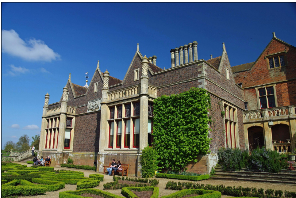
The rear of the house overlooking the river, with the beautifully restored bay windows and finials, and the partèrre garden of neatly trimmed box hedges, now fully planted for the new season with spring flowers.

It was a record-breaking start to the season over the February half term week, and Charlecote visitors enjoyed the beginning of the new season, with walks in the park and visits to the house. The kitchen proved to be a great attraction with the cooks busy on most days, preparing food over the open fire. The wraps came off after the recent conservation work on the front porch and restoration work is progressing in other parts of the buildings. Currently, the steps leading down from the partèrre to the river are undergoing repairs, but the partèrre itself is looking lovely with spring flowers in the formal hedged beds. The Easter weekend will see the Cadbury Easter Egg Trail, 6-9 April, and shortly after Easter the first of the lambs will be born. The house will open from 11.00am to 4.30pm every day except Wednesday and Thursday, and the park will be open daily as usual. The Orangery Restaurant has returned to a full meal service and is open until 5.00pm daily. A new range of items in the shop includes honey produced from the Charlecote bees, and the shop in the gatehouse has a wide range of local products. SF