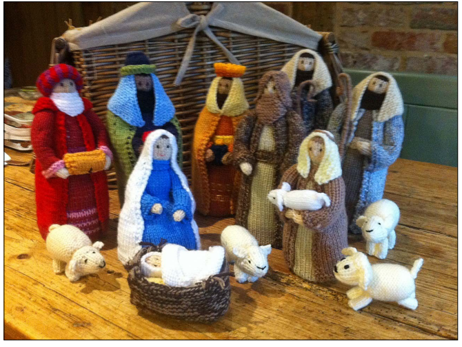
The beautifully knitted figures of the Travelling Nativity

During the month of December, in the days leading up to Christmas, many families in Hampton Lucy, and in some of the surrounding villages, shared in the true meaning of Christmas as they hosted a set of handknitted figures, depicting the scene of the Nativity. The 'travellers' moved from home to home, culminating in their arrival at the service of Holy Communion in St Peter's on Christmas morning. CP/ER