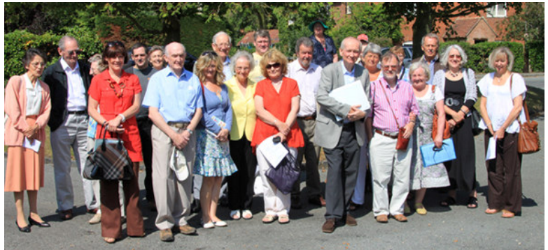
The Maries Family Reunion in Hampton Lucy