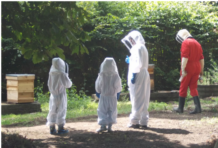
Learning about bee-keeping at Charlecote Park