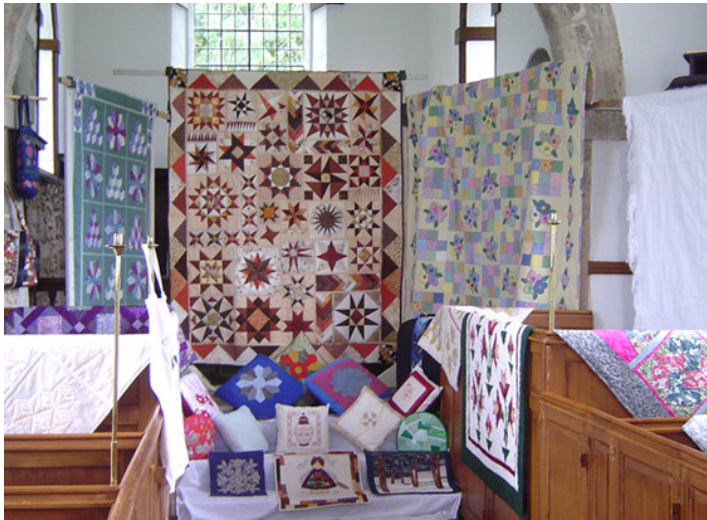
The work of the Cotton Reels at Loxley Strawberry Fayre