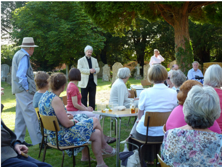
The Open Afternoon to celebrate the completion of Phase Two of the restoration works on the church in Hampton Lucy