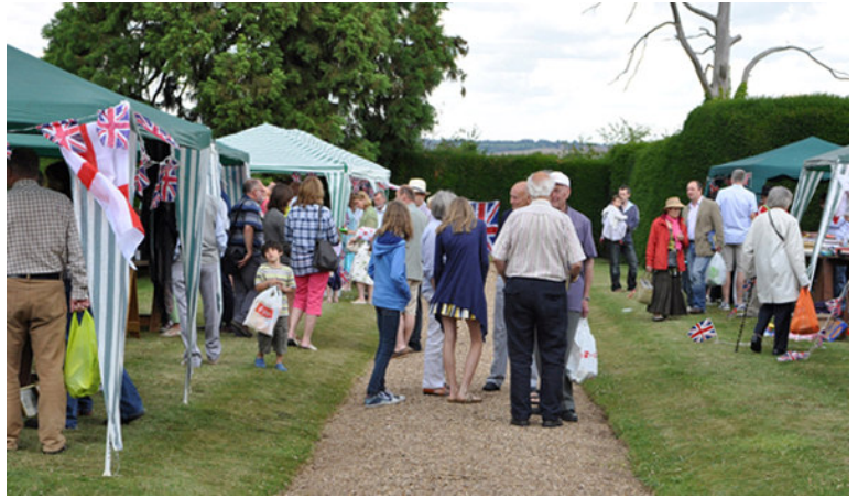
The stalls at the Loxley Strawberry Fayre