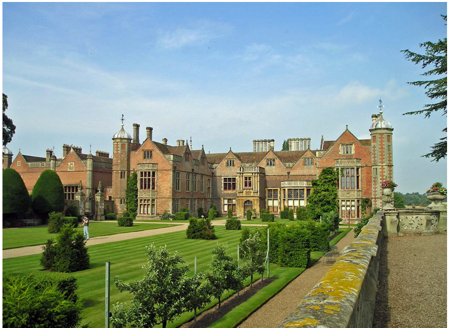
I know we always feature a photograph from The Park, but it is so photogenic!

Spring has definitely arrived at Charlecote. The house opened in early March and scaffolding around the gatehouse was due to come down soon after, leaving a viewing platform for visitors to enjoy a panoramic view of the house, park and surrounding countryside. A virtual tour of Charlecote is now available in the carriage house, giving easy access to many details. Until the end of April there will be conservation tours taking approximately twenty minutes, between 11am and 12 noon, giving an insight into how the staff care for the delicate interior of the house. Talks about Elizabethan costumes, as worn by the lady of the house when Charlecote was newly built, can be enjoyed by visitors on most days. The Victorian kitchen often has cookery demonstrations and hands-on kitchen activities, always popular with the children. Easter brings special "Easter Trails" for the children, from 22 to 25 April.