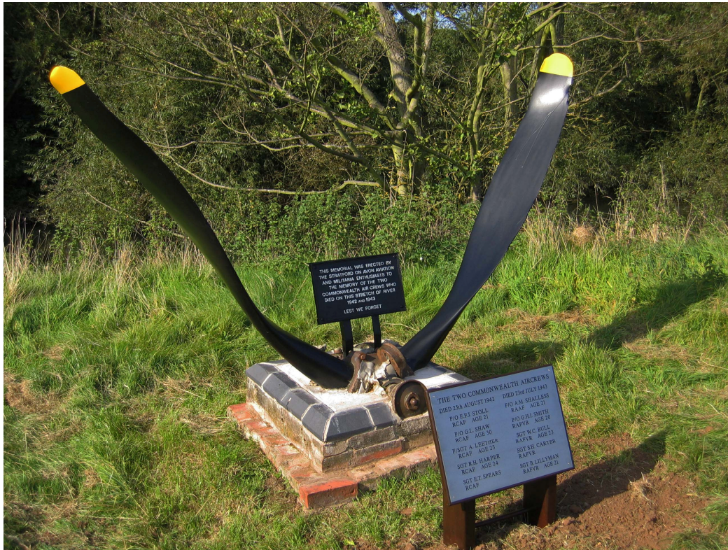
The restored Memorial, with its dedication to the ten young airmen.