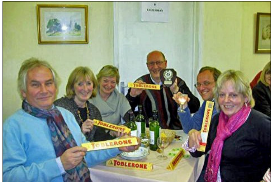
The Eastenders with their winnings (and three empty bottles!)