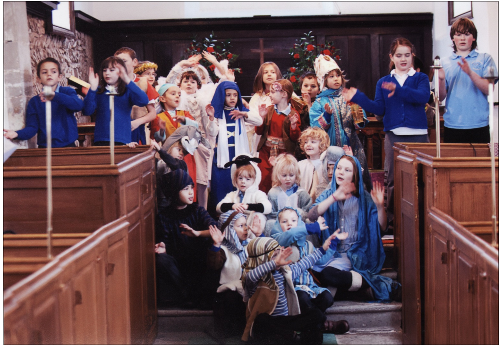
Loxley School 'Rock 'n Roll' Nativity - every one a star!