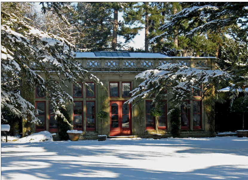
The Orangery Restaurant, bedecked with festive snow

Christmas came to Charlecote Park with the festive weather, seasonal Victorian-style decorations, a wind ensemble and Christmas singing. Father Christmas paid his usual visit, of course. The new year will be a busy one for staff who, in addition to the usual thorough winter cleaning programme, will be helping the National Trust Book Conservator in the first year of a five year programme of work on the remarkable collection of books in the library. Although the house remains closed for the winter, the Park is open daily, and the Orangery will be serving light snacks and drinks. Why not enjoy a bracing winter walk followed by a warming coffee and cake? The sculpture trail is still in place; large mice don't seem to mind the snow. Work on the gatehouse has been delayed due to the cold weather, but will continue when possible. When it is all completed the bells for