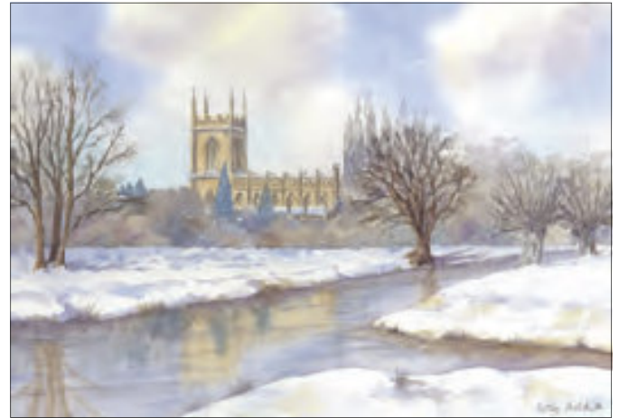
Hampton Lucy Church in winter