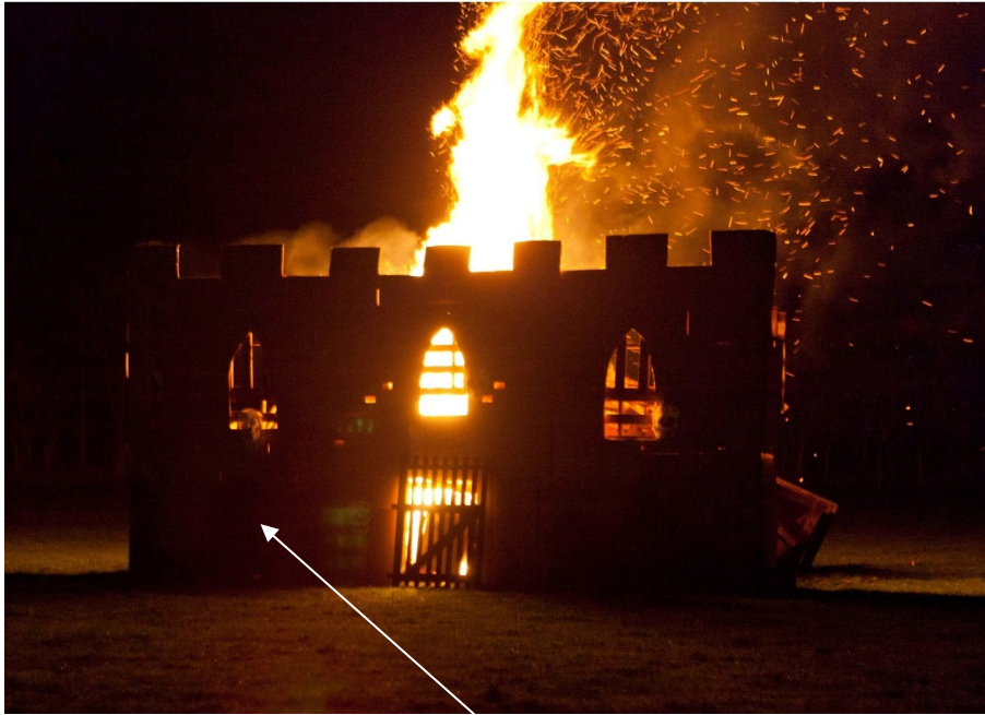
(Ed's note – can you spot Guy Fawkes' ghost?)