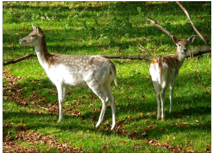
Me and my girl! A fallow doe with her fawn, showing off on the Deer Park Safari in October.