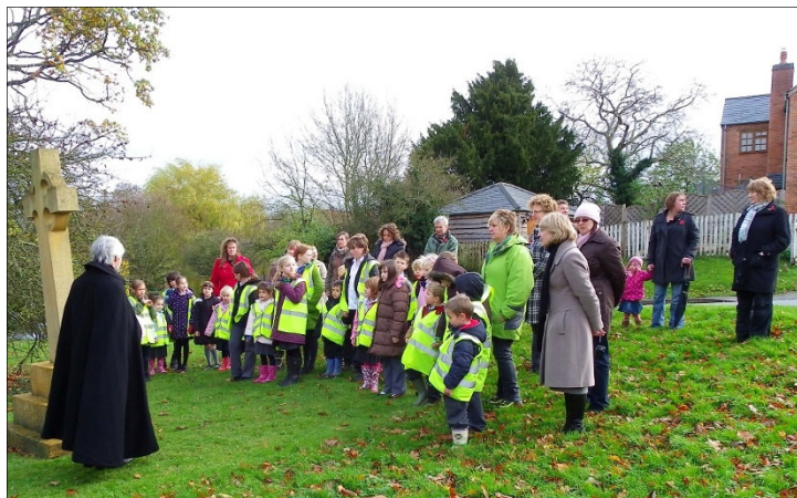
Remembrance Day service with Loxley School.