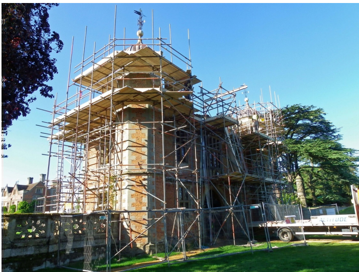
The Tudor gatehouse at Charlecote Park shrouded in