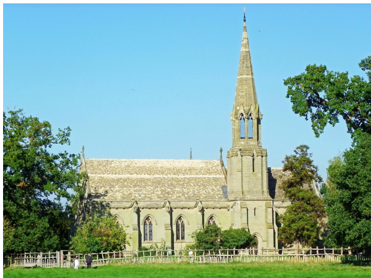
The soft October sunshine showing off the splendid new tiles on the main roof of St Leonard's Church