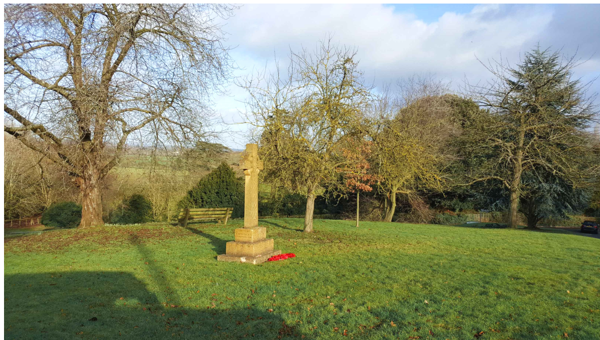
Taken in January 2018