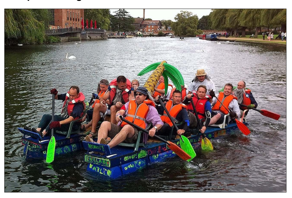
It's amazing what a glass or two of Malibu can do!

A team of dads from Hampton Lucy C of E Primary School and Nursery once again took part in the Lions Club Raft Race on Saturday, 16 September, the race having been postponed in June due to the high river levels. The event proved to be a fantastic fundraiser as usual, with the 'Friends of the School' and the Lions' chosen charity 'Different Strokes' each benefiting to the tune of over £800. The race itself was a long (slow!) slog this year, with the dads' raft crossing the finishing line in just under 6 hours. Morale remained high to the end, however, and the children provided their usual enthusiastic support by the Hampton Lucy weir and at the finish line. Thanks go to all those who took part and supported the team, and to the Stratford and the Wellesbourne &