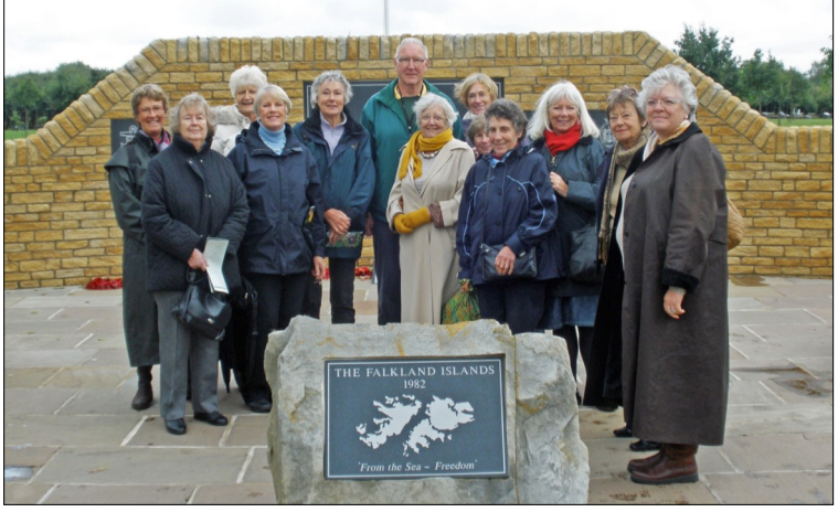
The WI members at the Falklands Memorial, commemorating the lives lost in the campaign, including the three civilian women killed by Argentinian artillery fire during the invasion.